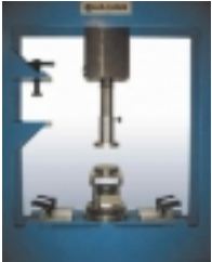
COMPRESSION ON CEMENT TEST SPECIMEN