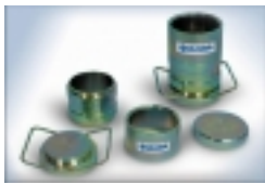
ANTI CORROSION TREATED STEEL MARSHALL MOULD - COVER