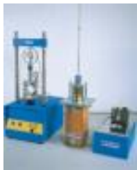
MANUAL MARSHALL TEST MACHINE 50KG