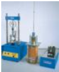
MANUAL MARSHALL TEST MACHINE 50KG