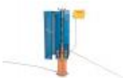
MARSHALL AUTOMATIC COMPACTOR