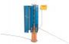
MARSHALL AUTOMATIC COMPACTOR