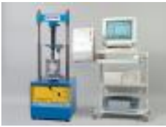
AUTOMATIC MARSHALL TEST MACHINE 50 KN