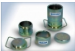
ANTI CORROSION TREATED STEEL MARSHALL MOULD - BASE WITH HANDLES