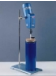
LIME REACTIVITY TEST