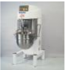
LABORATORY MIXER 40 L FOR LARGE PARTICULE SIZE MIX