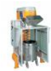
TWO ROTATION MIXER FOR COATED MATERIALS 25L