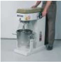
LABORATORY MIXER 20L