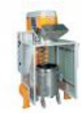
TWO-ROTATION MIXER FOR COATED MATERIALS 45L