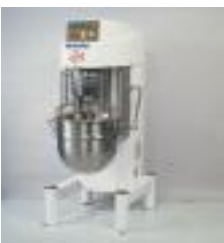
LABORATORY MIXER 40 L FOR LARGE PARTICULE SIZE MIX