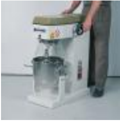
LABORATORY MIXER 40 L