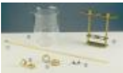
RING FOR RING BALL APPARATUS