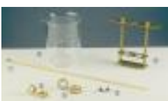
GUIDE FOR RING BALL APPARATUS