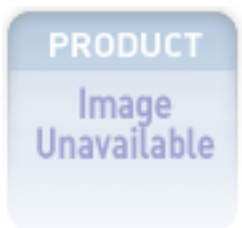
BALL FOR RING BALL APPARATUS