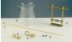
AUTOMATIC RING BALL APPARATUS