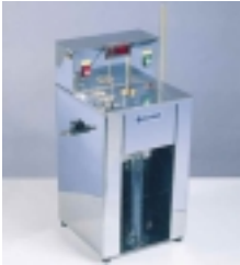
BRTA-REDWOOD-STV VISCOMETER 1 STATION