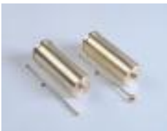
PLUG DIAMETER 2MM