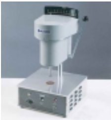
VISCOSIMETER ICI 40