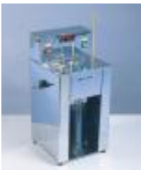
CUP DIAMETER 10MM